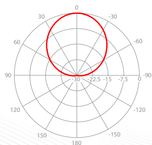
V/H - Port Pattern Azimuth 5.6 GHz